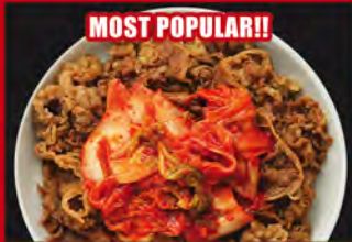
MOST POPULAR!! KIMCHEE BEEF RICE BOWL MINI $11.75 MED $13.75 LRG $15.75