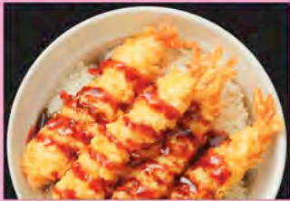
SHRIMP TEMPURA RICE BOWL MINI $12.50 (2pc Tempura) MED $15.00 (3pc Tempura) LRG $17.00 (5pc Tempura)