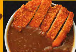
PORK KATSU CURRY RICE BOWL MED $17.95 LRG $19.25