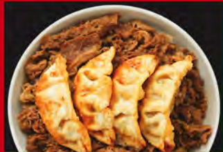
GYOZA BEEF RICE BOWL MINI $13.00 (3pc Gyoza) MED $16.00 (4pc Gyoza) LRG $18.00 (5pc Gyoza)