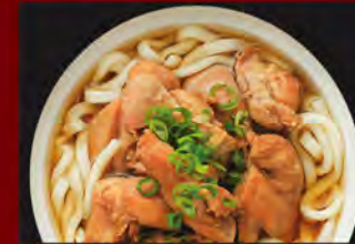
CHICKEN UDON MED $14.00 LRG (EXTRA NOODLES) $16.00