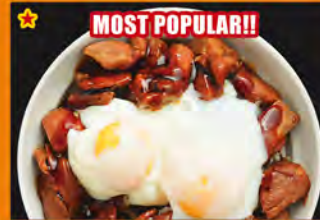
MOST POPULAR!! ONTAMA EGG TERIYAKI CHICKEN RICE BOWL MINI $12.00 (1 Egg) MED $14.25 (2 Eggs) LRG $16.25 (2 Eggs)