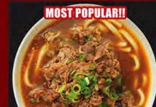
MOST POPULAR!! BEEF CURRY UDON MED $14.50 LRG (EXTRA NOODLES) $16.50