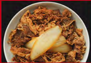
BEEF RICE BOWL MINI $10.95 MED $12.95 LRG $14.95