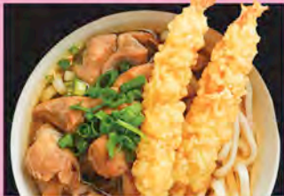
SHRIMP TEMPURA CHICKEN UDON MED $16.00 (2pc Tempura) LRG (EXTRA NOODLES) $18.00 (2pc Tempura)