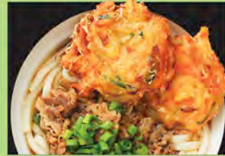
VEGETABLE TEMPURA BEEF UDON MED $16.00 (2pc Tempura) LRG (EXTRA NOODLES) $18.00 (2pc Tempura)