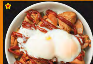
MOST POPULAR!! ONTAMA EGG SPICY MISO CHICKEN RICE BOWL MINI $12.00 (1 Egg) MED $14.25 (2 Eggs) LRG $16.25 (2 Eggs)