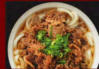
BEEF UDON MED $14.00 LRG (EXTRA NOODLES) $16.00