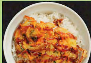
VEGETABLE TEMPURA RICE BOWL MINI $12.50 (2pc Tempura) MED $15.00 (3pc Tempura) LRG $17.00 (5pc Tempura)