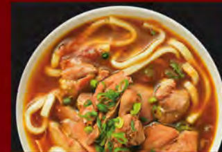
CHICKEN CURRY UDON MED $14.50 LRG (EXTRA NOODLES) $16.50