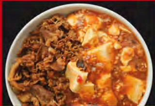
MAPO TOFU BEEF RICE BOWL MINI $12.00 MED $14.25 LRG $16.25