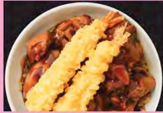
SHRIMP TEMPURA CHICKEN RICE BOWL MINI $13.00 (1pc Tempura) MED $16.50 (2pc Tempura) LRG $19.00 (3pc Tempura)