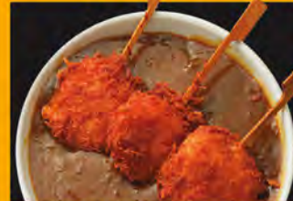
SHRIMP KATSU CURRY RICE BOWL MINI $13.00 (2pc Katsu) MED $16.00 (3pc Katsu) LRG $18.00 (4pc Katsu)