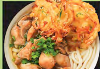
VEGETABLE TEMPURA CHICKEN UDON MED $16.00 (2pc Tempura) LRG (EXTRA NOODLES) $18.00 (2pc Tempura)