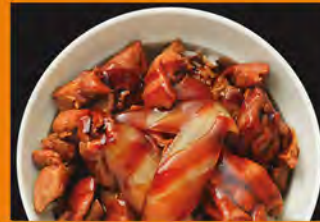
TERIYAKI CHICKEN RICE BOWL MINI $10.95 MED $12.95 LRG $14.95