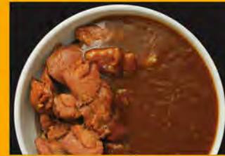
CHICKEN CURRY RICE BOWL MINI $11.75 MED $13.75 LRG $15.75