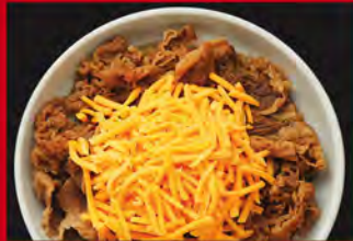
CHEESE BEEF RICE BOWL MINI $11.75 MED $13.75 LRG $15.75