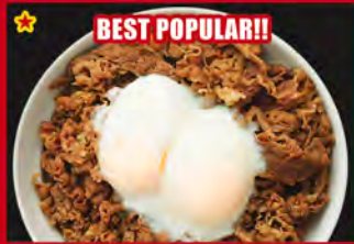
BEST POPULAR!! ONTAMA EGG BEEF RICE BOWL MINI $12.00 (1 Egg) MED $14.25 (2 Eggs) LRG $16.25 (2 Eggs)