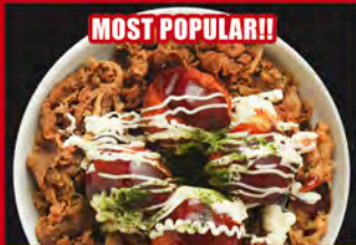
MOST POPULAR!! TAKOYAKI BEEF RICE BOWL MINI $15.95 (3pc Takoyaki) MED $17.95 (3pc Takoyaki) LRG $19.95 (5pc Takoyaki)