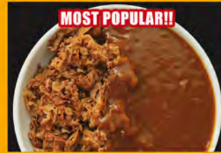
MOST POPULAR!! BEEF CURRY RICE BOWL MINI $11.75 MED $13.75 LRG $15.75