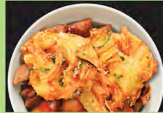
VEGETABLE TEMPURA CHICKEN RICE BOWL MINI $13.00 (1pc Tempura) MED $16.50 (2pc Tempura) LRG $19.00 (3pc Tempura)