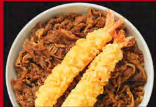
SHRIMP TEMPURA BEEF RICE BOWL MINI $13.00 (1pc Tempura) MED $16.50 (2pc Tempura) LRG $19.00 (3pc Tempura)