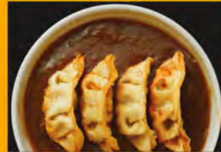
GYOZA CURRY RICE BOWL MINI $11.75 (3pc Gyoza) MED $13.75 (4pc Gyoza) LRG $15.75 (5pc Gyoza)