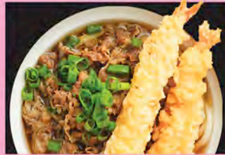
SHRIMP TEMPURA BEEF UDON MED $16.00 (2pc Tempura) LRG (EXTRA NOODLES) $18.00 (2pc Tempura)