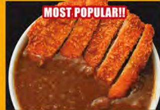
MOST POPULAR!! CHICKEN KATSU CURRY RICE BOWL MED $17.95 LRG $19.25