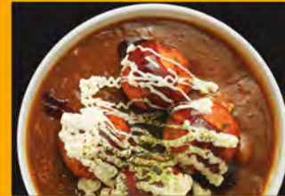
TAKOYAKI CURRY RICE BOWL MINI $13.00 (3pc Takoyaki) MED $16.00 (4pc Takoyaki) LRG $18.00 (5pc Takoyaki)