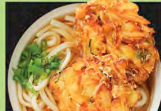
VEGETABLE TEMPURA UDON MED $13.95 (2pc Tempura) LRG (EXTRA NOODLES) $15.95 (2pc Tempura)